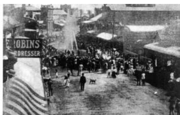
Fire Brigade competition, Townsville v. Charters Towers at Charters Towers, 1897.

More information will be disseminated after a community meeting being held in October.