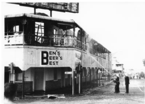
Unknown (1970). Fire at the Victoria Bridge Hotel, South Townsville.