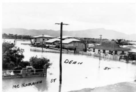
Floodwaters in Dean and McIlwraith Streets, South Townsville, 1946.