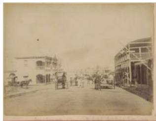
Allom & Bailey (1890). Views of Charters Towers, Queensland, approximately 1890.