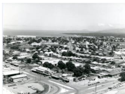
Unknown (1976). Oblique aerial view of South Townsville, showing the intersection of Palmer and Dean Streets, 1976.